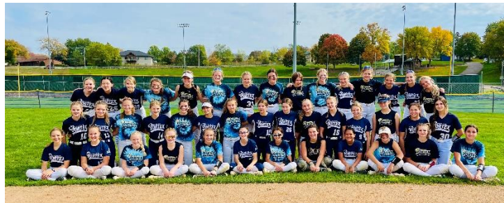
All 4 Vortex 14U teams at Fall scrimmages/BBQ/Yard Games Event in Loretto

Fall: 3-4 tournaments with 1 out of town Summer: 6-7 tournaments with 1-2 out of town